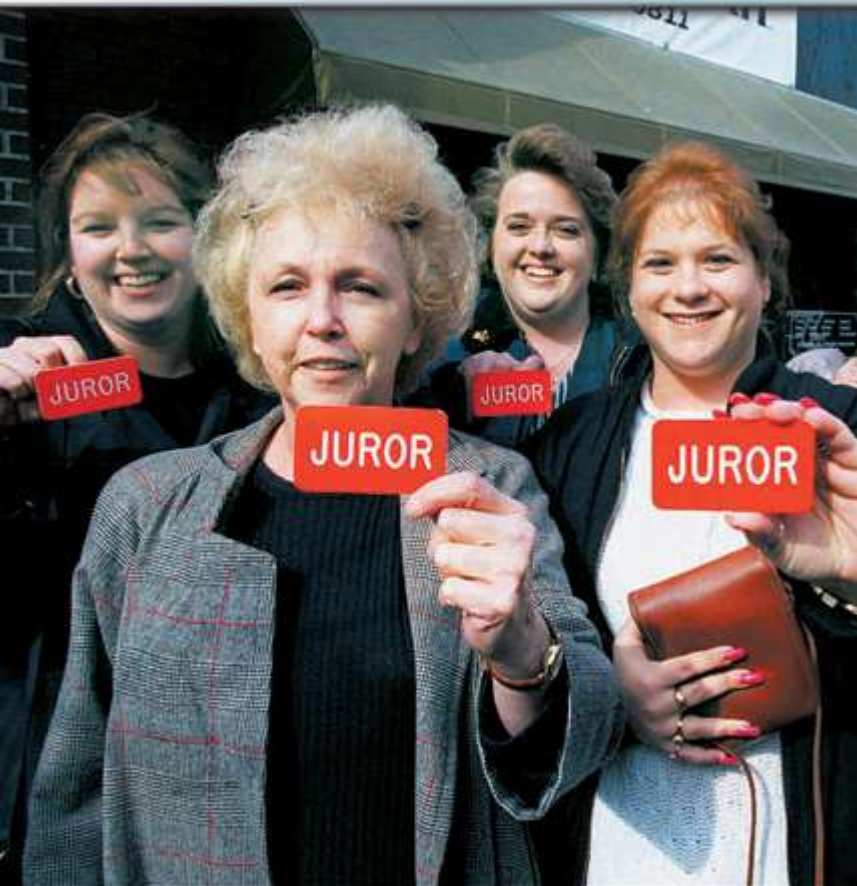
These citizens proudly display their juror identification.

draft, p. 125 rationed, p. 125 jury duty, p. 125